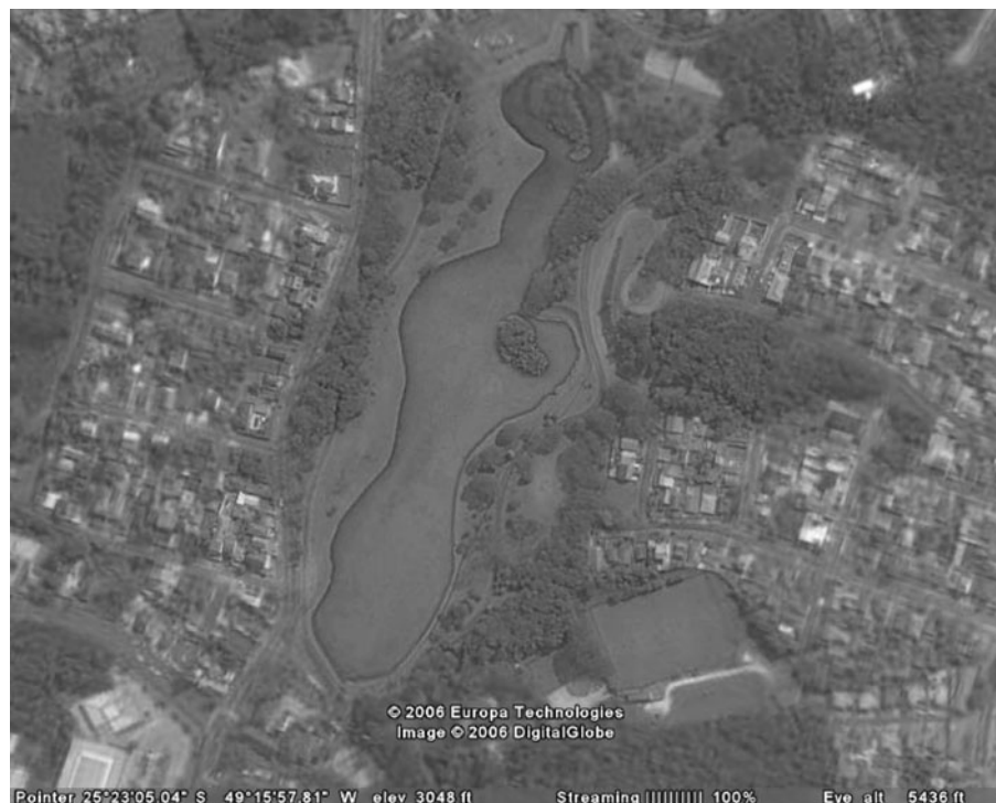
Fig. 1 Satellite image of São Lourenço Park (Curitiba, Southern Brazil). The sampling site is in the center of the image (lake from the damming of the Belém River in the region). Note the remarkable degree of urban occupation around the lake.

The samplings of the heavy metals copper, nickel, and zinc were performed using decontaminated glass bottles at the same sampling sites as the physiochemical and microbiological analyses. Samplings were performed in two different seasons (November 2005 and July 2006). The heavy metal analyses were performed on 100 mL of each sample by adding 20 mL of nitric acid p.a. This solution was heated on a hot plate until 60 mL of the original solution had evaporated. After reaching room temperature, 40 mL of ultra-pure water were added to obtain a final solution of 100 mL for a proper analysis. The solution remained stored in a volumetric balloon. The readings